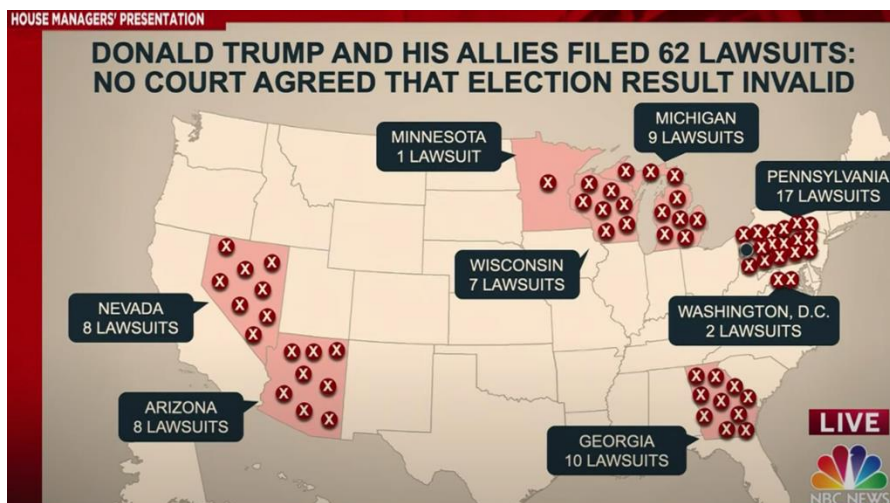
Figure 5: Trump's lawsuits