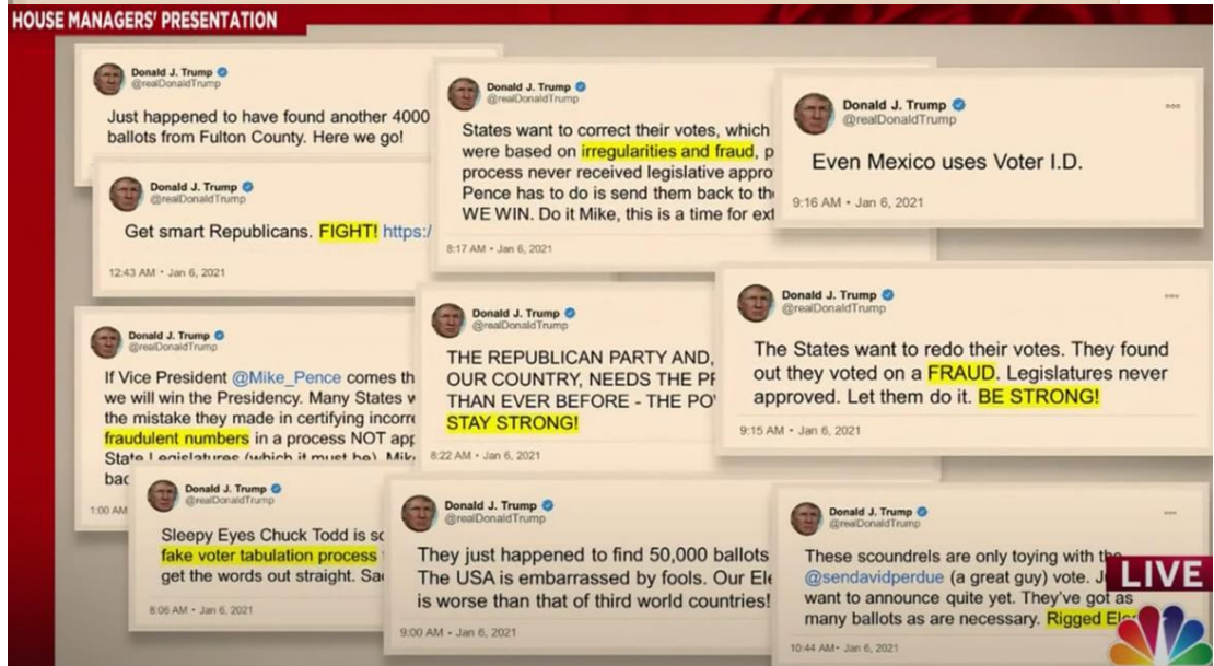
Figure 2, 3, and 4: Trump spread misinformation on his Twitter