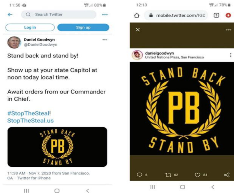
Figure 1: The Proud Boy adopted Trump's phrase

having the Commander-in-Chief join with military commanders and condemn extremism and white supremacists in the military is vital, reiterating importance of keeping extremists out of the military. 155 Concerns about the danger of white nationalism, however, were downplayed by President Trump. Not only did he fail to act during his administration, but he showed evident sympathy with those extremist militia groups. For example, he was asked in the September 29, 2020 Presidential debate whether he would "condemn while supremacists and militia groups and say that they need to stand down." 156 The Commander-in-Chief of the U.S. refused to condemn the Proud Boys---a militant nativist group---on national television. Instead, he said that the Proud Boys should "stand back and stand by". The Proud Boys adopted that phrase as their official slogan and created merchandise with the slogan (see figure 1, page 49).